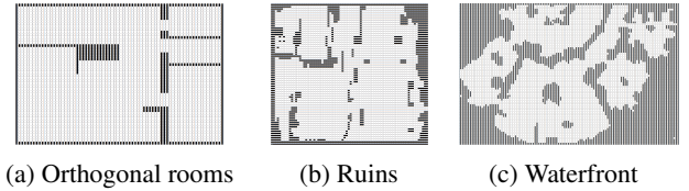
Figure 3: Three different maps used in the evaluation

The instances used in the practical experiments are generated using a pseudo random generator, but in a controlled manner. An instance is defined by its map, the ratio |A| : |D| and locations of individual defenders, attackers and their targets. These three entries form an input of the instance generation procedure. Further, we select rectangular areas inside which agents of both teams and the attackers' targets are placed randomly. The experiments are conducted on 3 different maps that vary in their structure (see Fig. 3).